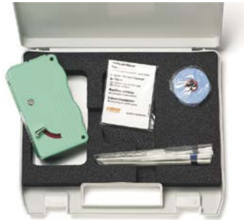
OCK-10 Optical Connector Cleaning Kit (accessory)