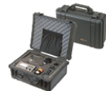
Pelican carrying case