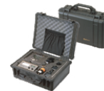
Pelican carrying case