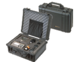
Pelican carrying case