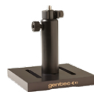
Stand with delrin post